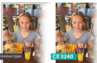
The above are simulated images

The FUJIFILM CX 3240 enables you to quickly and easily create borderless, double-sided pages for a variety of cards, photobooks, and more, providing the kinds of products your customers demand.