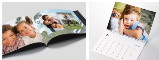
Automatic double-sided printing enables easy creation of greeting cards, photobooks and calendars.